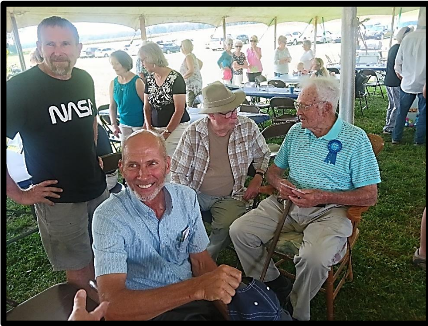
The Birthday Man visiting with Friends!