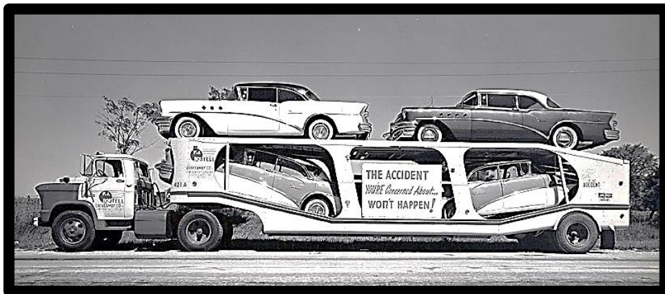
Buicks on the carrier. Wonder where they were going?

If you know in advance you will be attending, please contact the person listed on the schedule. If not, no worries you can simply join us for a good evening.