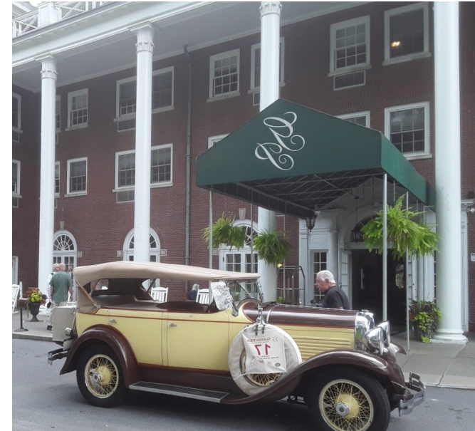
The Deno's 1929 Marmon

A few minor parts and a little TLC and I will be better than new!