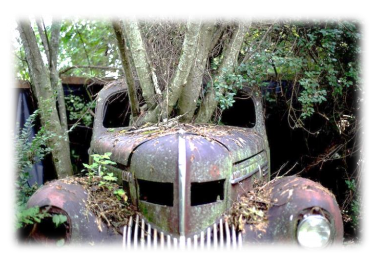
Who Am 1