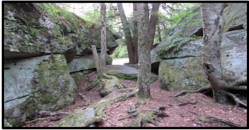
Spectacular rock formations!