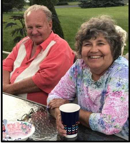
Great evening! Enjoying Dessert!