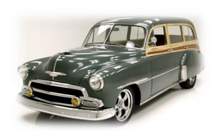
1951 Chevrolet Fleetline

Respectfully submitted, Patricia B. Swigart,