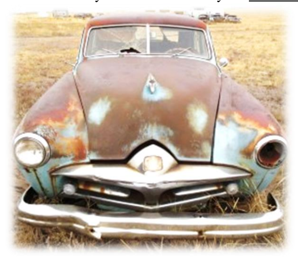
This 1951 Frazer May Be Gone But Not Forgotten

The Frazer (1946–1951) was the flagship line of upper-medium priced American luxury automobiles built by the Kaiser-Frazer Corp.