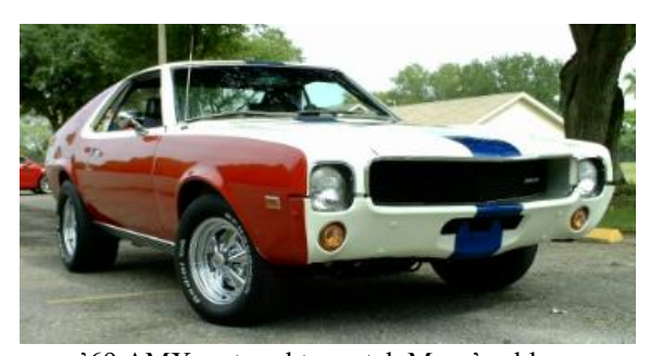
'69 AMX restored to match Mom's old car

Now here's the bummer: I told him I would be interested in buying it and he said he would only sell it for $50,000! I told him I could not give that kind of money and left it at that, but I did buy another '69 AMX from him for $2,500 and restored it to look like Mom's.