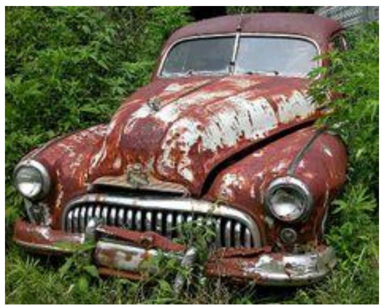
Buick Roadmaster rusty but a beautiful car