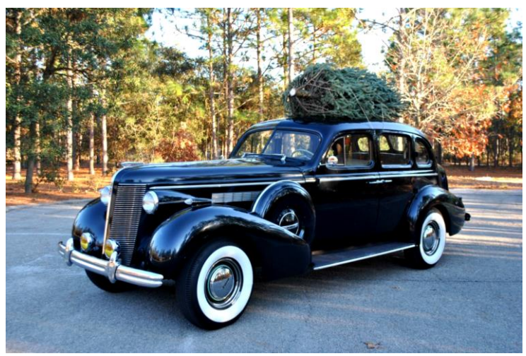
One of my more unusual local trips with my 1937 Buick to pick up a Christmas Tree a few years ago.

I am enjoying the slightly cooler weather here in Southeastern North Carolina. It seemed that summer did not want to end here this year. Now that the temperatures are a bit more Fall like, I am driving my 1937 Buick Century more often. I don't seem to like cooking very much so we go out to lunch and dinner probably more often than we should. It does give me a chance to enjoy driving my 1937 Buick and engaging in conversations with others about the car, the hobby, and AACA on a regular basis. Whenever I park the Buick, people seem to be naturally attracted to it and want to talk. I typically get approached with questions about the car at almost every stop.