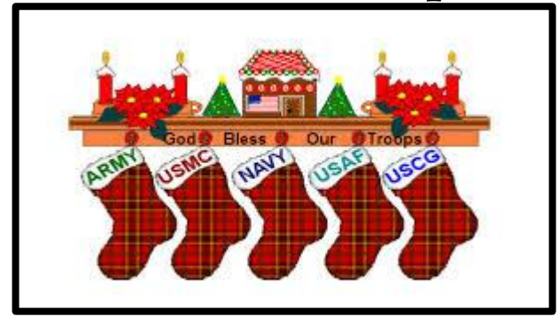
this holiday season!