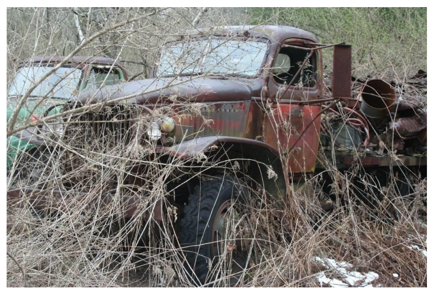
What truck is it?