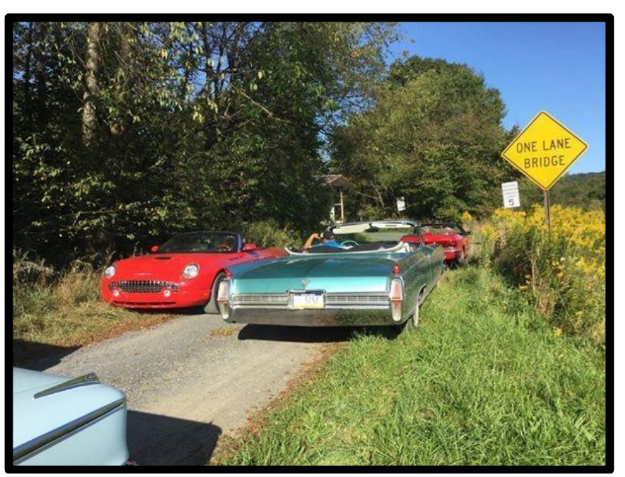
One lane road for one Lane Bridge