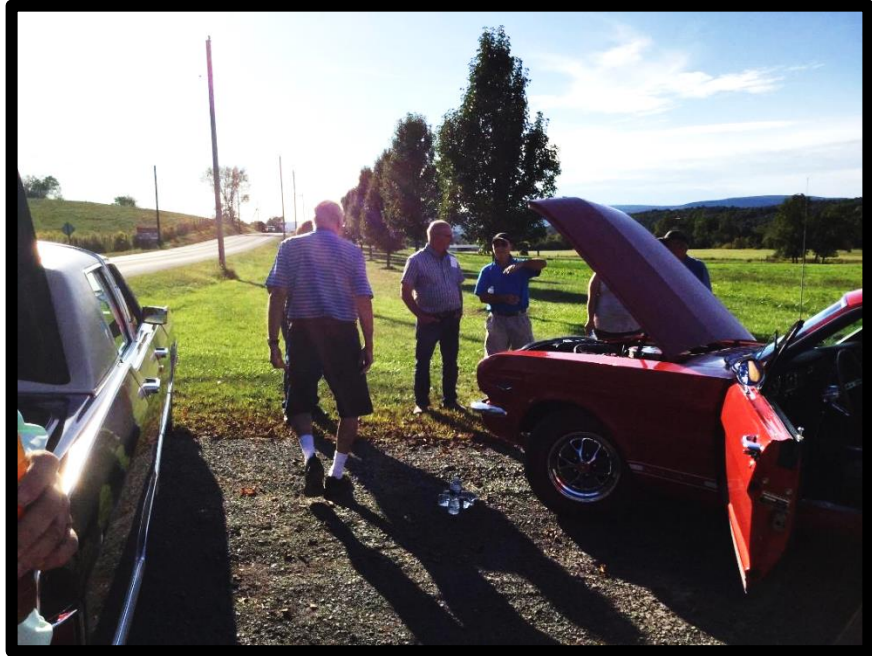
Taking a break while the car cools down