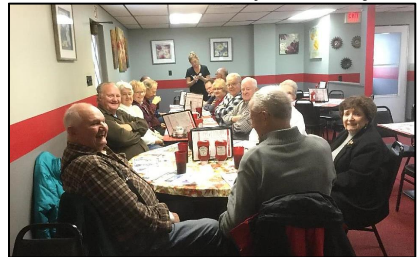
We never miss a meal!