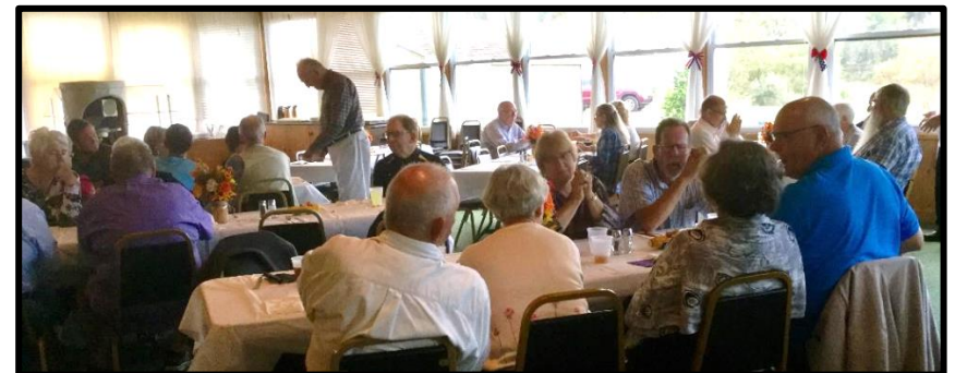
Members shared a great afternoon!