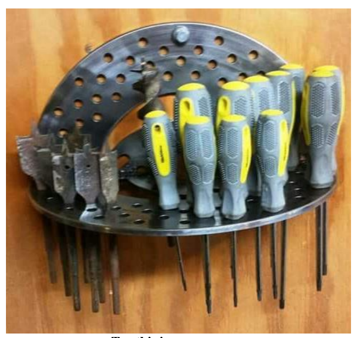
Try this in your garage.