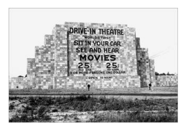
The first drive in Movie Theater was in Camden, NJ in 1933