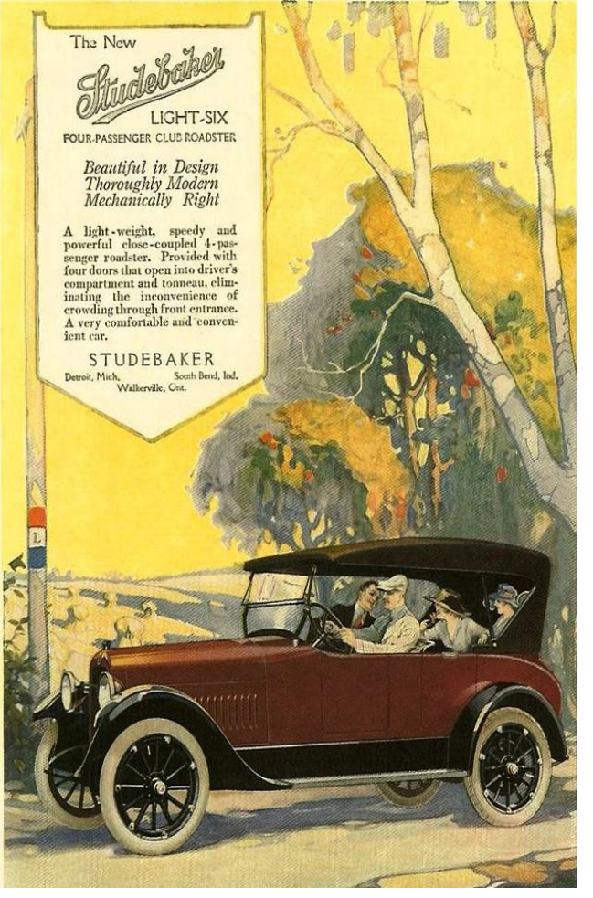
Four\ passengers\ Studebaker

more reliable. Rather than last several hundred miles, tires could last a few thousand miles. Also during 1912, the harmonic balancer was developed. It's made of rubber and metal and significantly reduces engine vibration.