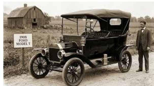
1908 Ford Model T