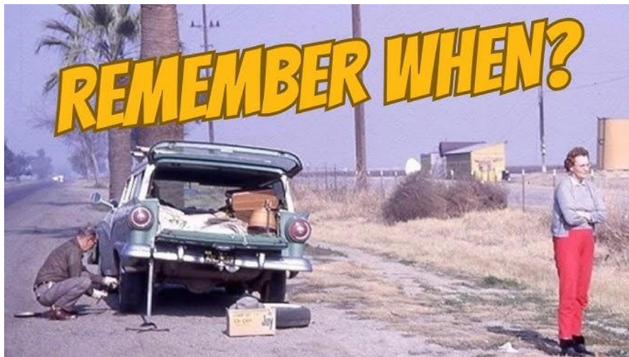
Oh No flat tire