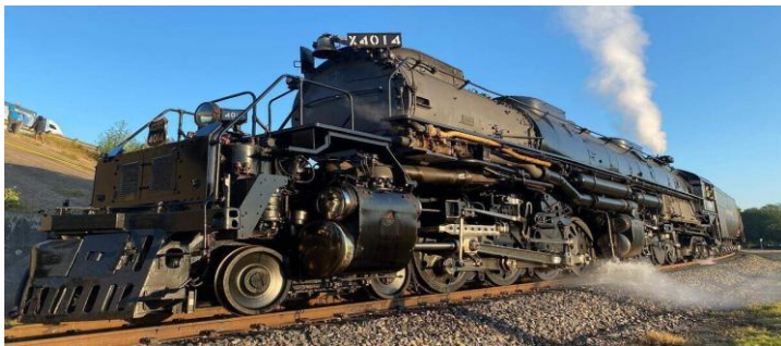
CHOO CHOO BIG BOY

Union Pacific issued guidance for those trying to get a view of Big Boy. The message, stay back from the tracks 25 feet, respect railroad property, and experience it safely.