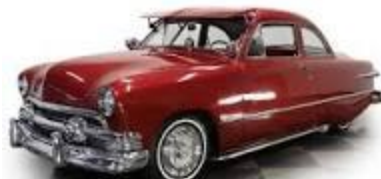
1951 Ford Deluxe

Curved Windshields: Moving away from the split, flat windshields of the 1940s, the seamless wraparound, one-piece curved windshield gained major traction across production models.