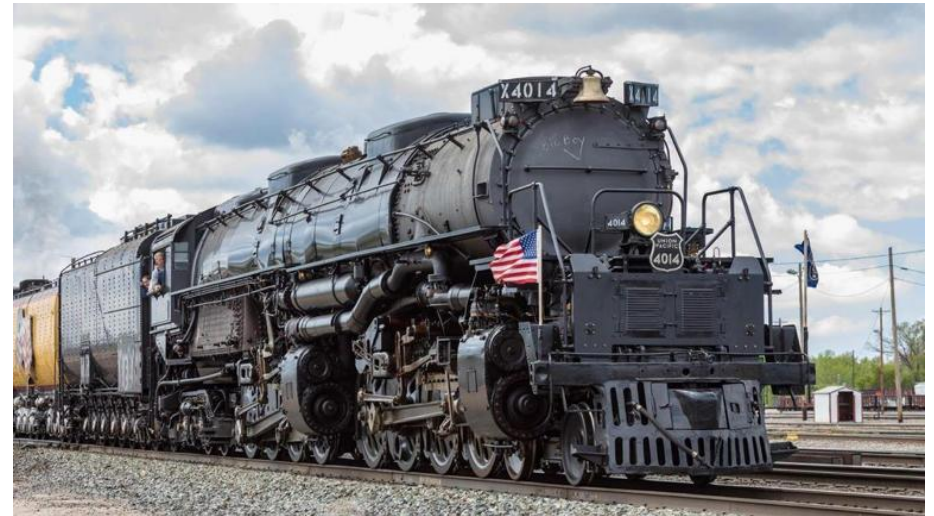
The 1.2-million-pound locomotive known as Big Boy No. 4014

Union Pacific's Big Boy was built in 1941 to haul heavy freight through the mountains of the American West. Big Boy 4014 is one of only eight surviving "Big Boy" locomotives and the only one still in operation today. Stretching more than 130 feet long and weighing over one million pounds.