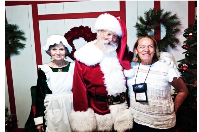
Santa looks happy!

Wednesday – we went back to Indiana and stopped at the Lincoln Pioneer Village in Rockport. It was then time to visit the Santa Claus Museum in Santa Claus, IN.