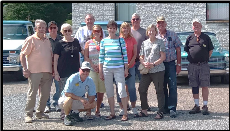
Happy Group of Old Car Enthusiasts!