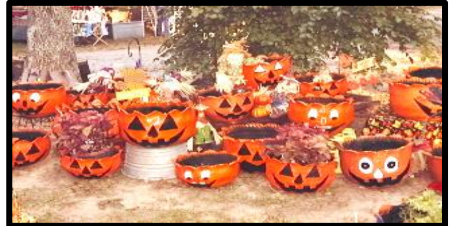
Recycle those tires.

This information was passed on to the National Office, but to date no response as to why the Swigart is not included in the historic background of the AACA.