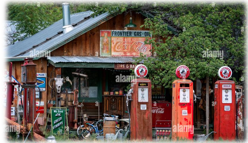
Did the "group" stop here for gas?