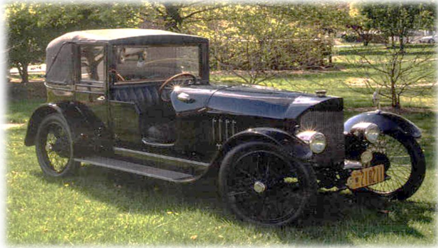
1916 Scripps Booth