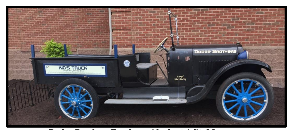
Dodge Brothers Truck outside the AACA Museum

Once again we grouped and went back on the trail. It was past lunch time so of course we had to eat, couldn't miss lunch.