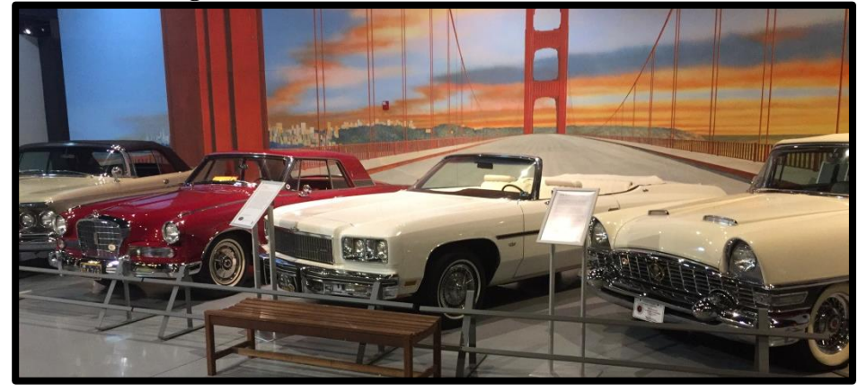
Beauties inside the Museum