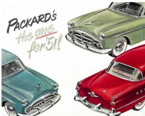
Car Slogan for 1951

These manufacturers controlled over 90% of the market later in the decade.