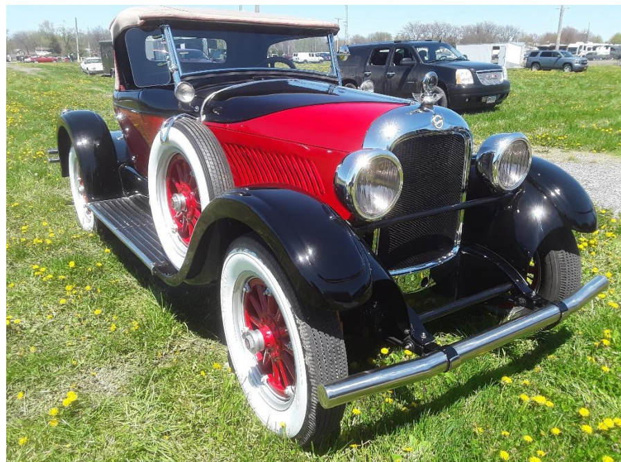
1926 Studebaker Boat tail roadster

Friday started with a visit to the Hans Herr House. Built in 1719, it is the oldest Mennonite meeting house in the western hemisphere and oldest building in Lancaster County. Interestingly, it appears their cash “crop” was distilled drink. Some things never change. The final stop was Barry's car barn with some nice classics and corvettes. The Closing banquet completed a great week with near perfect weather.