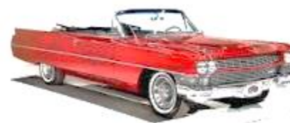
1964 Cadillac Deville