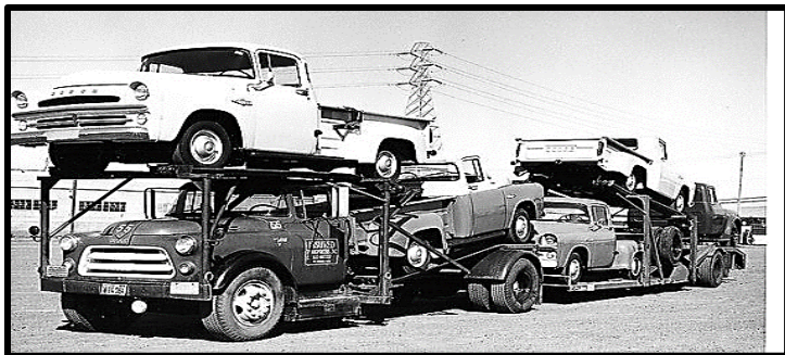
Loaded and ready to go!

Does your newsletter/website/social media have an inviting outreach quality? Would there be a vehicle for your members to share with their like-minded friends and acquaintances? What would you do if someone showed up at your event which they found on your website?