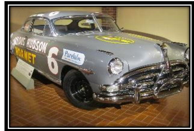
Fabulous Hudson Hornet