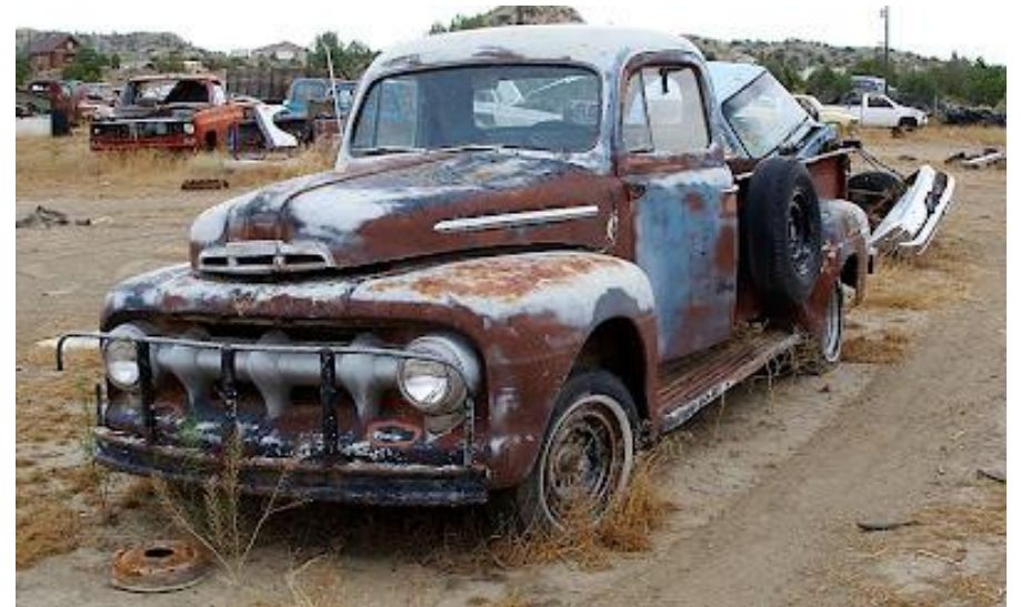
1951 Ford F100