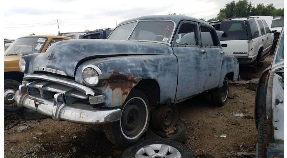
Top of the line 1951 Plymouth Sedan