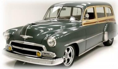
1951 Chevrolet Fleetline

Respectfully submitted, Patricia B. Swigart,