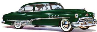
1951 Buick Roadmaster Sedan

You won't want to miss this!! Get the "old" car out and enjoy the afternoon with car club friends.