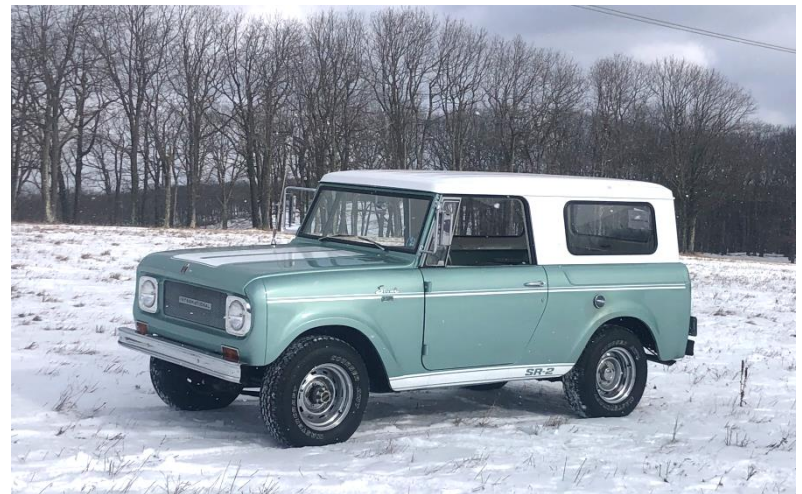
Zach Boring's 1965 International Scout