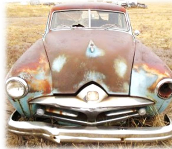
This 1951 Frazer May Be Gone But Not Forgotten

The Frazer (1946–1951) was the flagship line of upper-medium priced American luxury automobiles built by the Kaiser-Frazer Corp.