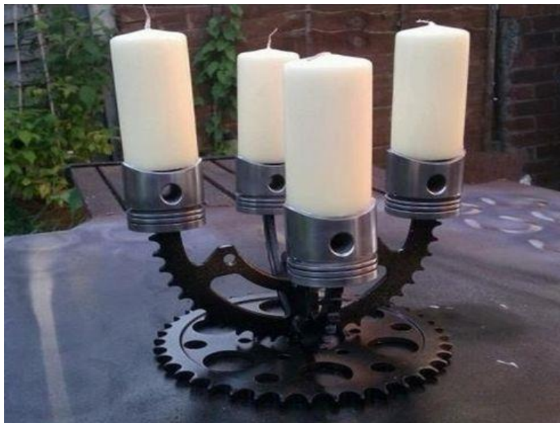
Ready for a romatic night?