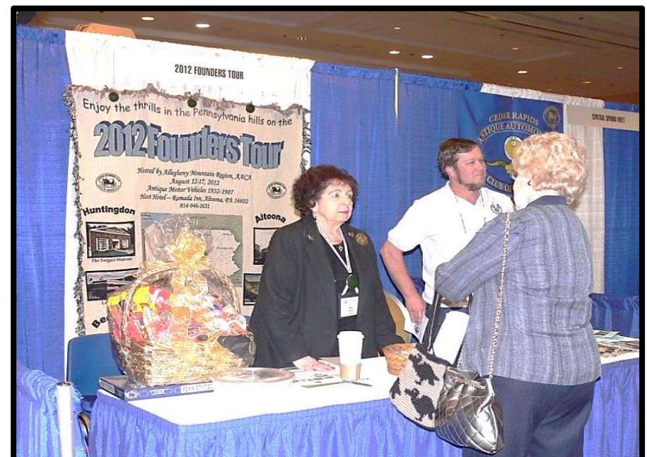
Promoting the 2012 Founders Tour in Philadelphia