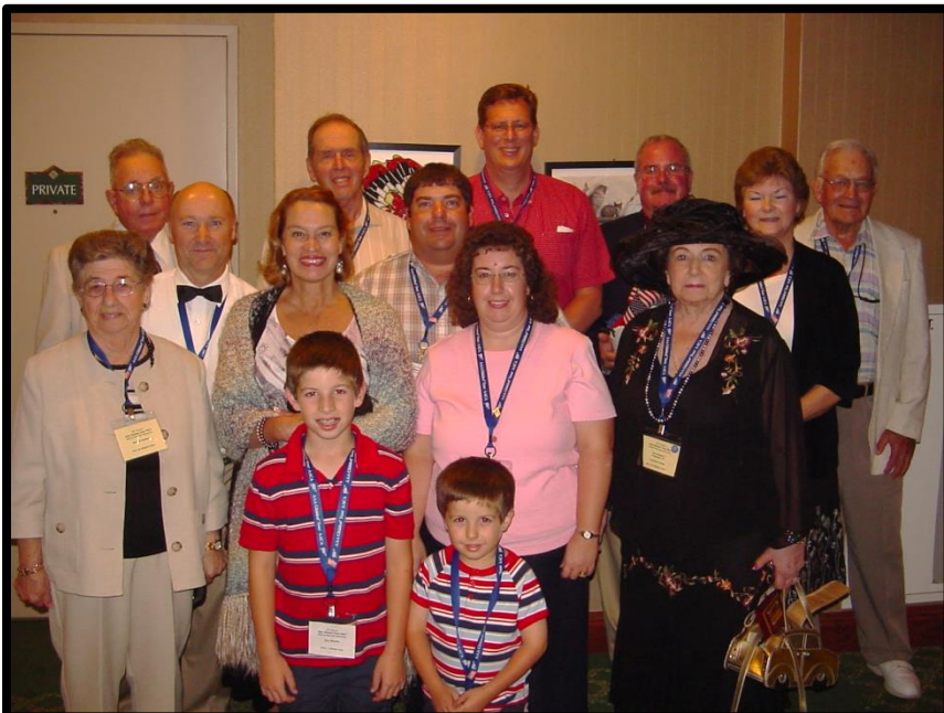
Glidden Tour group in 2011