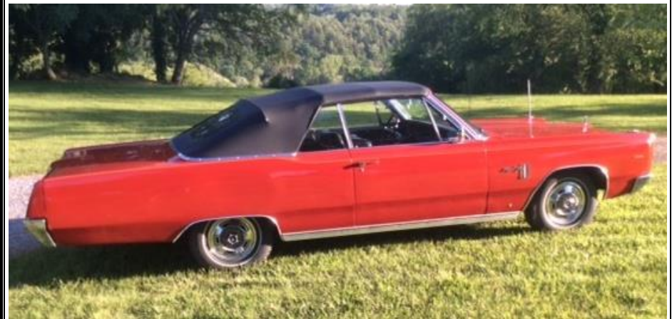
1967 Plymouth Sport Fury Convertible Owned by Don and Carol Foor