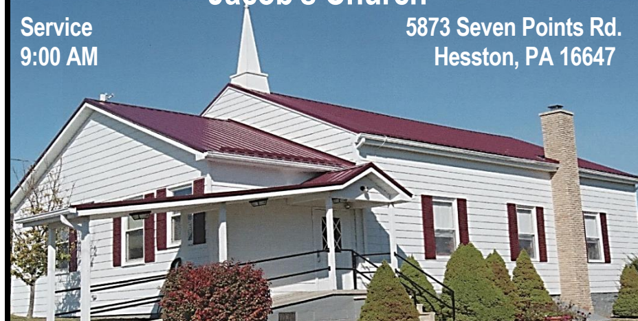
"A GREAT PLACE TO GO BEFORE THE SHOW"